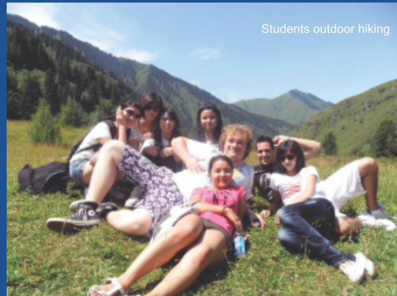
Students outdoor hiking