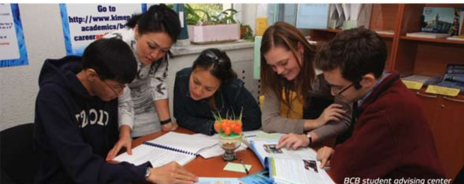
BCB student advising center

BSc graduates are found in every sector of the economy, in both local and international companies, with the highest concentration working in the banking industry. On graduation, you will be able to launch a career as a project manager, financial analyst, system administrator, human resource specialist, accountant or brand manager, to name just a few. Many of our graduates also choose to continue their education and complete graduate degrees.