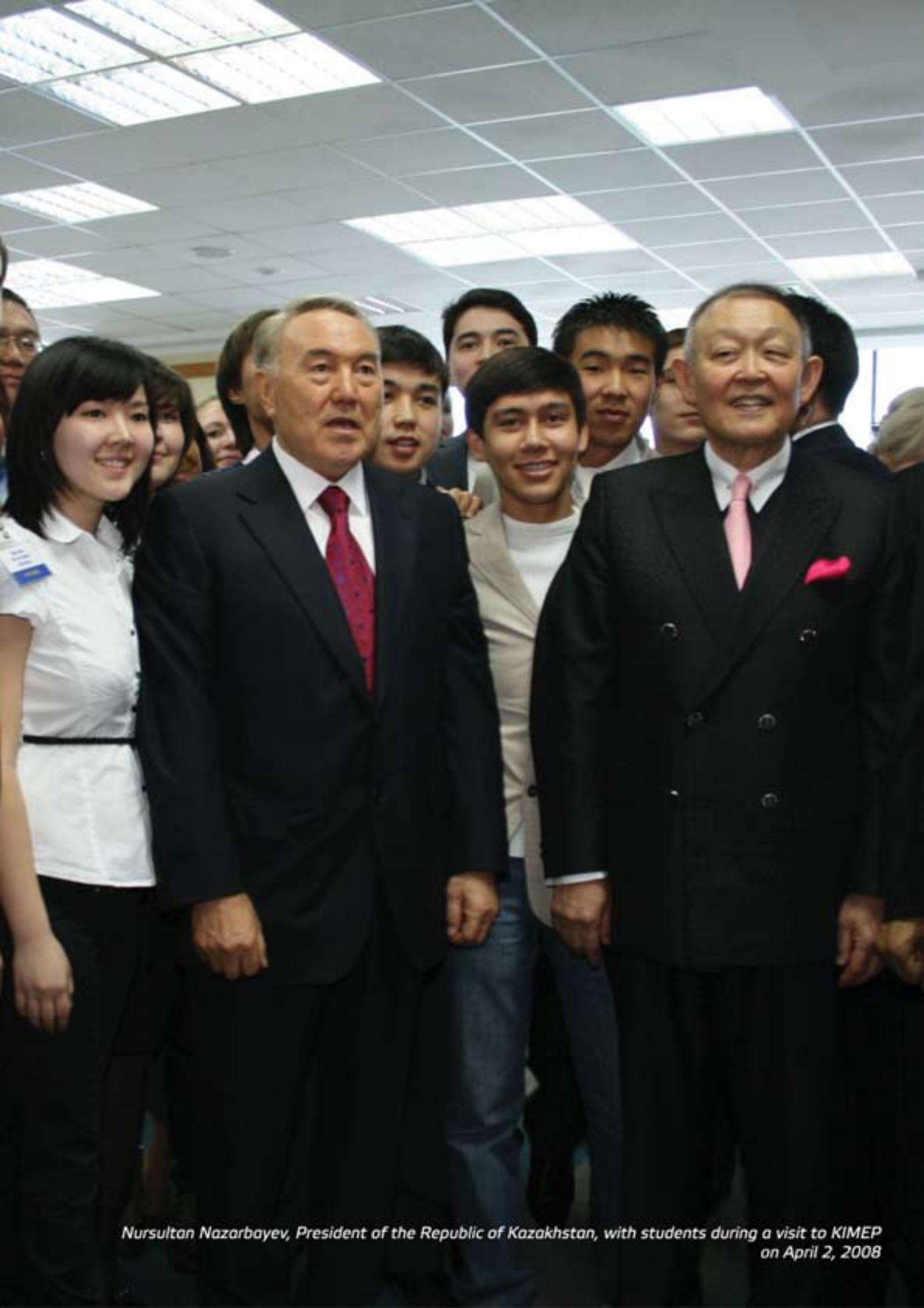
Nursultan Nazarbayev, President of the Republic of Kazakhstan, with students during a visit to KIMEP on April 2, 2008