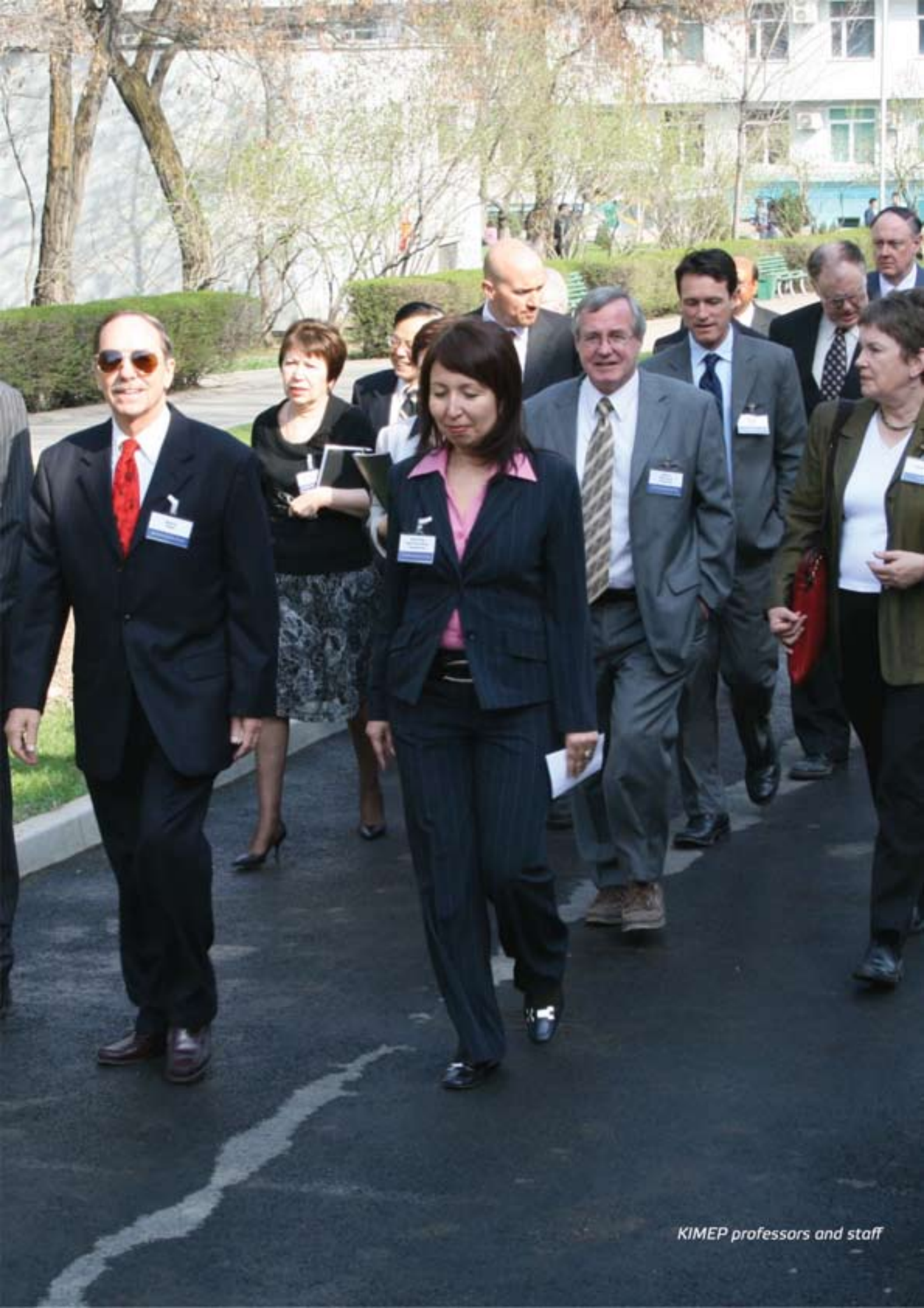
KIMEP professors and staff