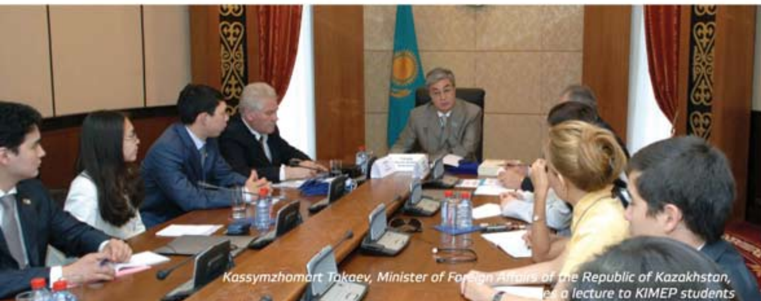
Kassymzhomart Tokaev, Minister of Foreign Affairs of the Republic of Kazakhstan, gives a lecture to KIMEP students