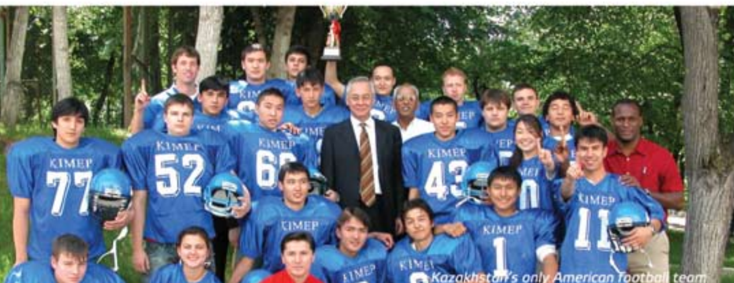
Kazakhstan's only American football team